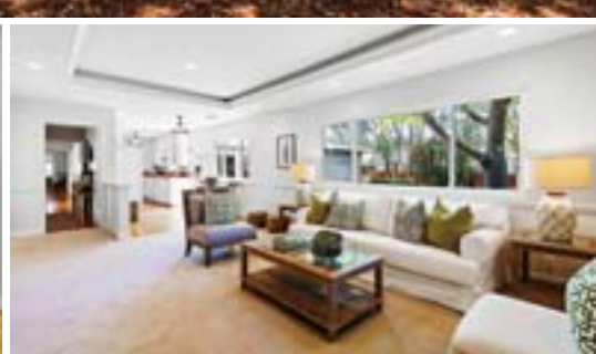
3164 Cordova Way, Lafayette | Burton Valley Neighborhood 3BD + office | 2BA | 1,840± SF | $1,325,000

Situated on a tranquil street in the heart of Burton Valley, sits a charming single story ranch home. A picturesque Chinese Elm Tree provides the ideal amount of shade, with a storybook swing under its canopy. The sweet distant noises of cows roaming the surrounding green hills can be heard while relaxing on the front porch. As the sun sets, this home glows in the abundance of the evening's natural light. A splendid place to call home, it is within walking distance to the top rated Burton Valley Elementary School, Rancho Colorados Swim and Tennis, Lafayette Community Fields, the Lafayette-Moraga trail and open space.